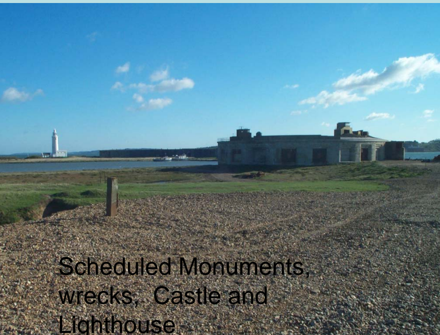
Scheduled Monuments, wrecks, Castle and Lighthouse