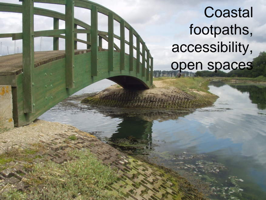
Coastal footpaths, accessibility, open spaces