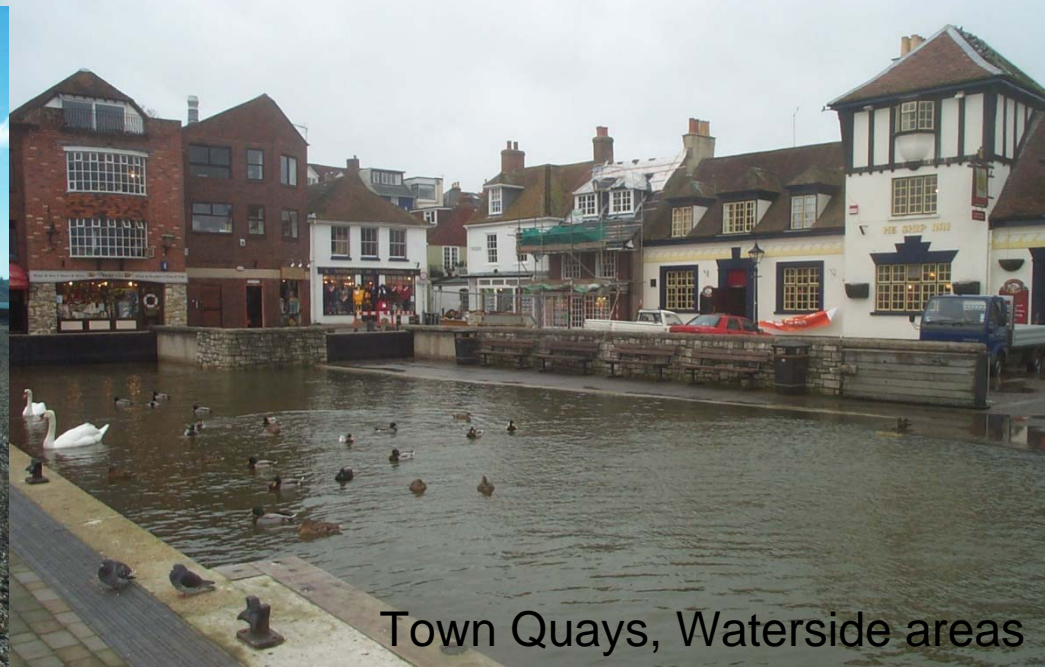
Town Quays, Waterside areas