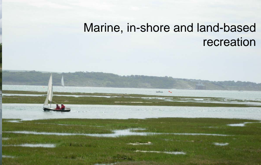
Marine, in-shore and land-based recreation